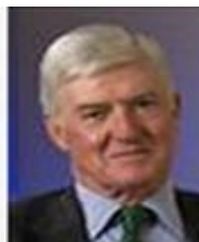
President The Rt Hon The Lord Parkinson